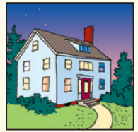
. . . or home